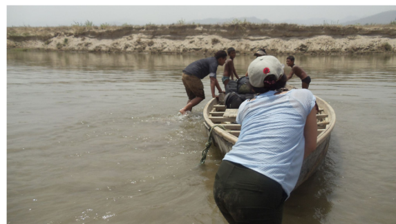
Figure 4 Access to a selected Terai district (Dang) in the Mid-Western development region is by boat.

the selected study sites. In a Mountain district in the Far-western development region, access to the selected village would necessitate crossing a river by manually-driven cable car, then travel via India.