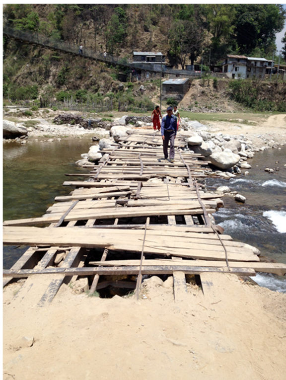
Figure 5 Access to a selected Mountain district (Sindhupalchok) in the Central development region is by bridge.