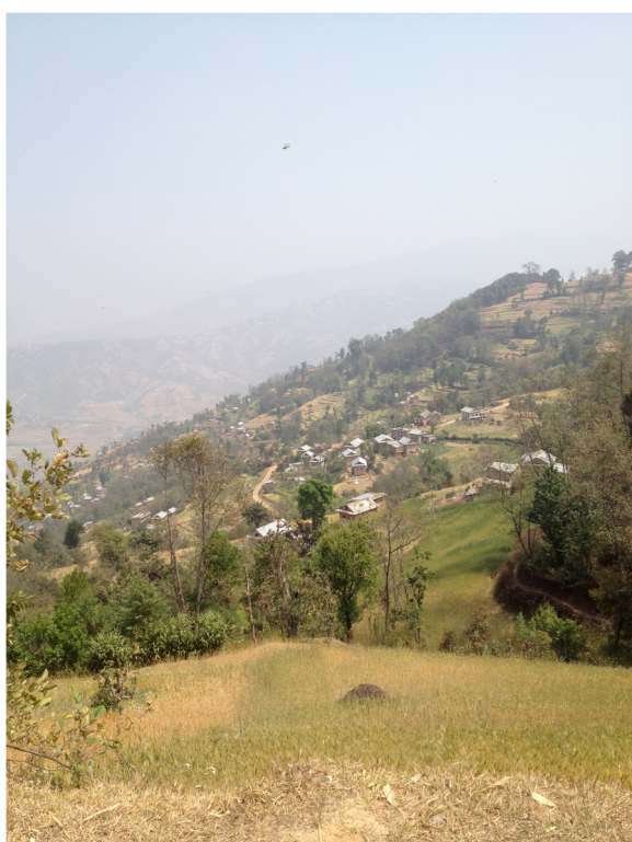
Figure 3 Households in a selected Hill district.

Three of the five Mountain districts were inaccessible by land. Even after flying to the nearest airports, two of these would require long uphill walks (Figure 6) to reach