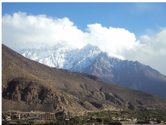
Figure 2 A selected Mountain district (Mustang) in the Western development region.

were necessary for rain-damaged roads, collapsed bridges (Figure 5) and (commonly) cancelled scheduled flights. The local member(s) of each team would guide the entire team (see sociocultural issues). The high likelihood of unforeseen complications meant a reserve team of interviewers should be kept available.