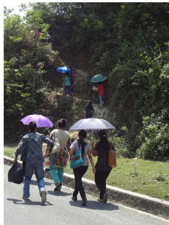
Figure 6 The journey to households in a selected Mountain district (Sindhupalchok) in the Central development region ends on foot and steeply uphill.

open their doors to an unknown and socioculturally different interviewer, and equally might not consent to be interviewed. This required recruiting interviewers with a fairly representative participation from all parts of the country, aiming to have at least one member in a team from the same district, or same physiographic division and development region, accustomed to the local culture.